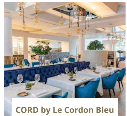
CORD by Le Cordon Bleu

Launched in 2022, CORD is the first dining concept from Le Cordon Bleu to open in London. It provides a unique offering of a fine dining restaurant, an all-day café and an outpost of Le Cordon Bleu's London culinary institute.