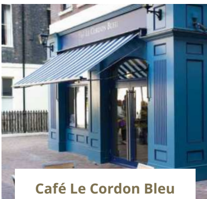
Café Le Cordon Bleu

Located on our campus and acting as a 'window' into the world of Le Cordon Bleu London, our Café showcases a range of the finest French pâtisseries, viennoiseries, gourmet sandwiches and hot dishes.