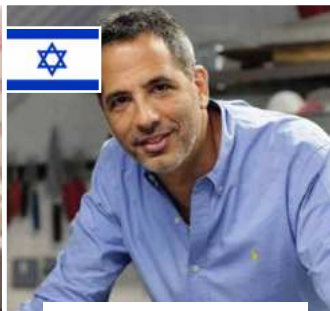
YOTAM OTTOLENGHI Diplôme de Pâtisserie Chef, Restaurant Owner & Food Writer