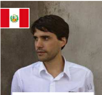
VIRGILIO MARTÍNEZ Grand Diplôme® Chef Patron

"[Le Cordon Bleu was] crucial for my development and I know now that if I wouldn't have done it, it would have taken me another 10 years probably to get where I am now."